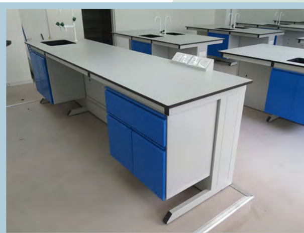
Lecturer's bench with 1 sink and 1 under bench cabinet