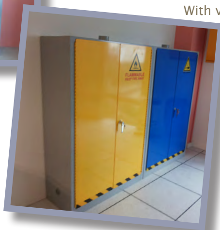
ACID / CORROSIVES LIQUID STORAGE CABINET (BLUE)

Overall size: L1092 x W457 x H1651mm With 2 adjustable shelves With 2 swing doors Capacity: 45 gallons (170 litres) Cabinet made of 18 gauge steel With vent hole on top of cabinet Body colour: yellow