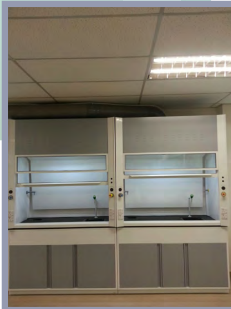
5ft size fume cupboard with extra washing sink inside the working chamber