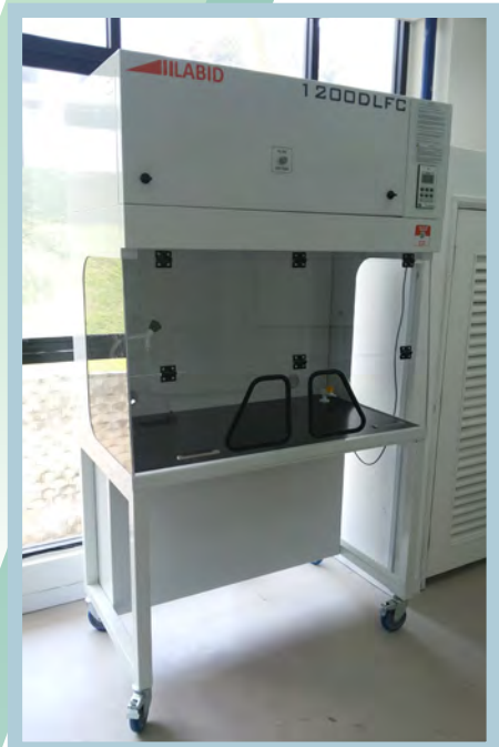
4ft size ductless fume hood with front and side clear glass panel for ease of teaching purposes