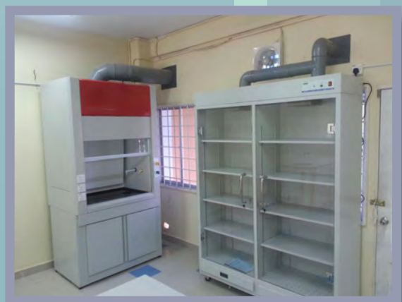
4ft size ducted fume cupboard with basic water and electrical fittings