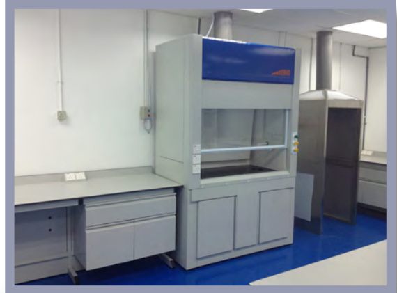
5ft size general purpose fume cupboard

centrifugal fan and blower which extracts the fume and release it to the outer atmosphere via ducting work that runs beyond the roof level