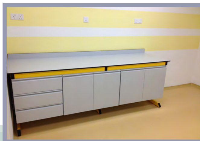
Wall bench with 2 swing door cabinets and drawer cabinet