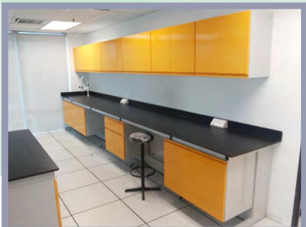
Wall bench with wall hung cabinet