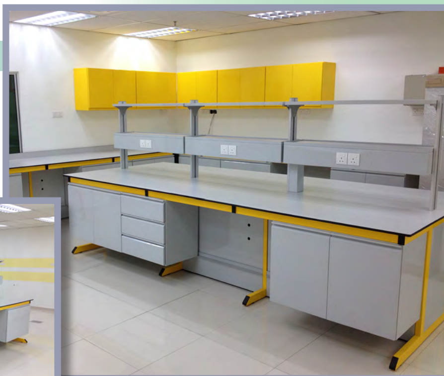
Island bench with C frame support and 2 tier reagent rack