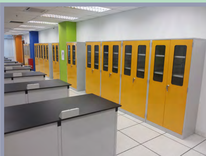
Tall storage cabinet with lock provide extra storage space