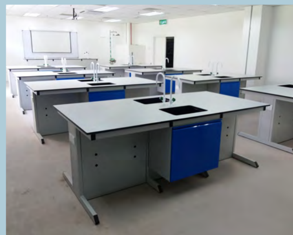
Island bench with seating capacity of 4 pax and 2 washing area. A simple 32 pax lab facility.