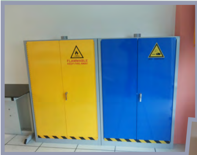
FLAMMABLE LIQUID STORAGE CABINET (YELLOW)

Overall size: L1092 x W457 x H1651mm With 2 adjustable shelves With 2 swing doors Capacity: 45 gallons (170 litres) Cabinet made of 18 gauge steel With vent hole on top of cabinet Body colour: yellow