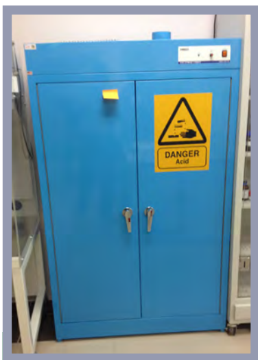
ACID/CORROSIVES LIQUID STORAGE CABINET

With 2 adjustable shelves & 3 PP trays With 2 swing doors Capacity: 45 gallons (170 litres) Cabinet made of 18 gauge steel With vent hole on top of cabinet Body colour: blue