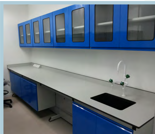
Wall bench with wall hung cabinet on top