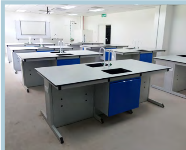
Island bench with seating capacity of 4 pax and 2 washing area. A simple 32 pax lab facility.