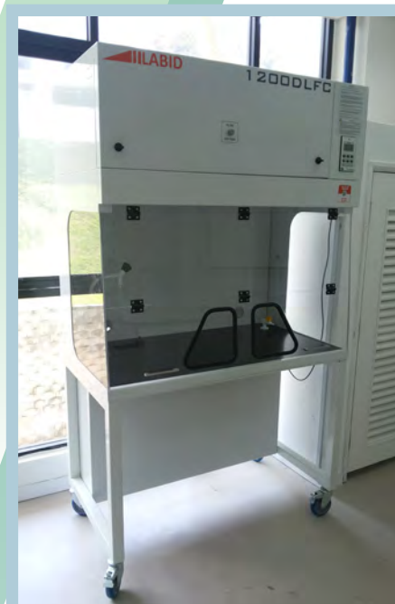
4ft size ductless fume hood with front and side clear glass panel for ease of teaching purposes